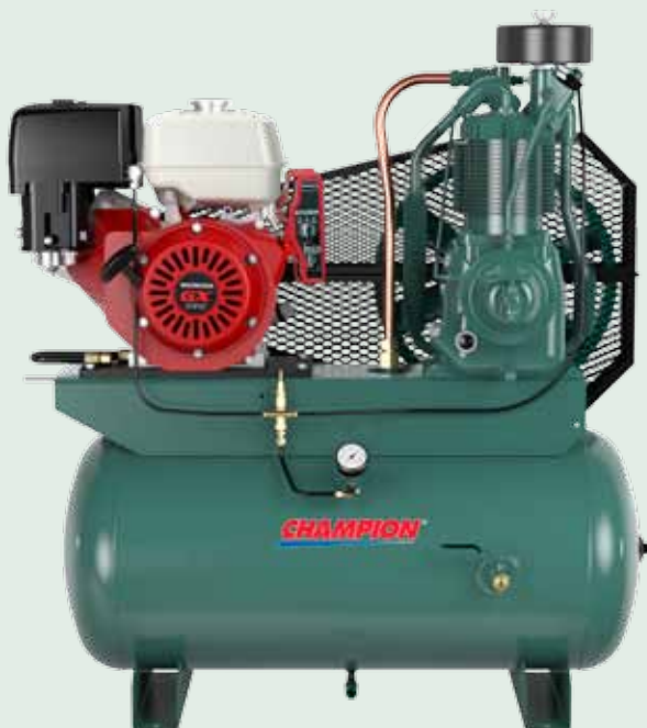
Tank Mounted Gas Driven